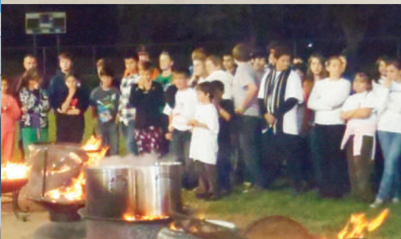
Street Beat (below)