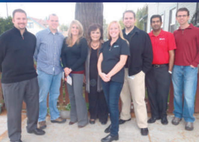
PG&E Coats for Kids Volunteers

Thank you VCMS... for being our 2010 spotlight, but also for being a spotlight in our community.